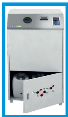
Automated formalin dispensing system