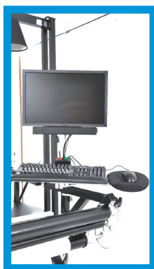
Computer monitor and keyboard stand